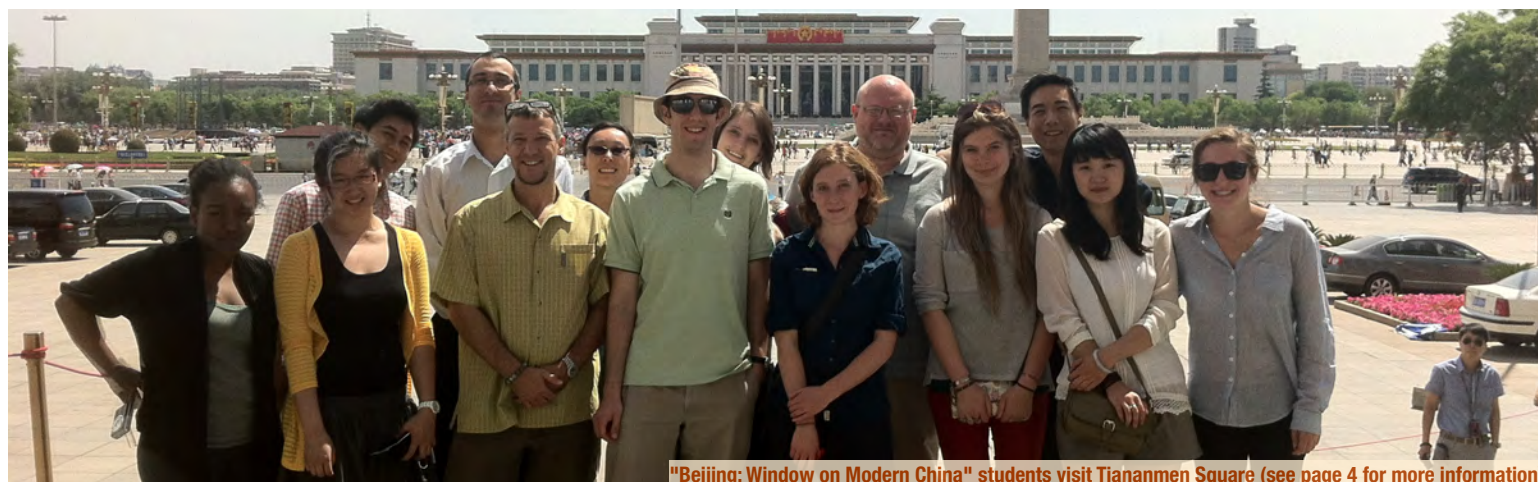
"Beijing: Window on Modern China" students visit Tiananmen Square (see page 4 for more information)