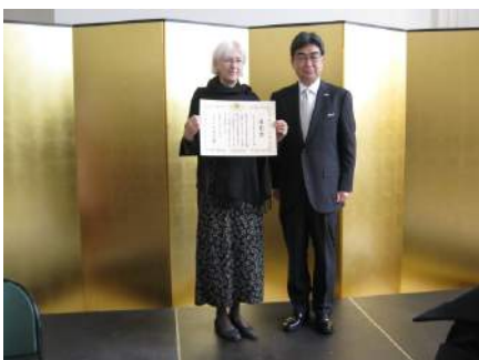
Dr. Rodd poses with Consul General Ikuhiko Ono upon receipt of the Foreign Minister's Commendation for the promotion of mutual understanding and goodwill between the people of Japan and the United States.

the promotion of awareness and understanding of Japanese culture and language, and have contributed significantly to greater mutual understanding between Japan and the United States."